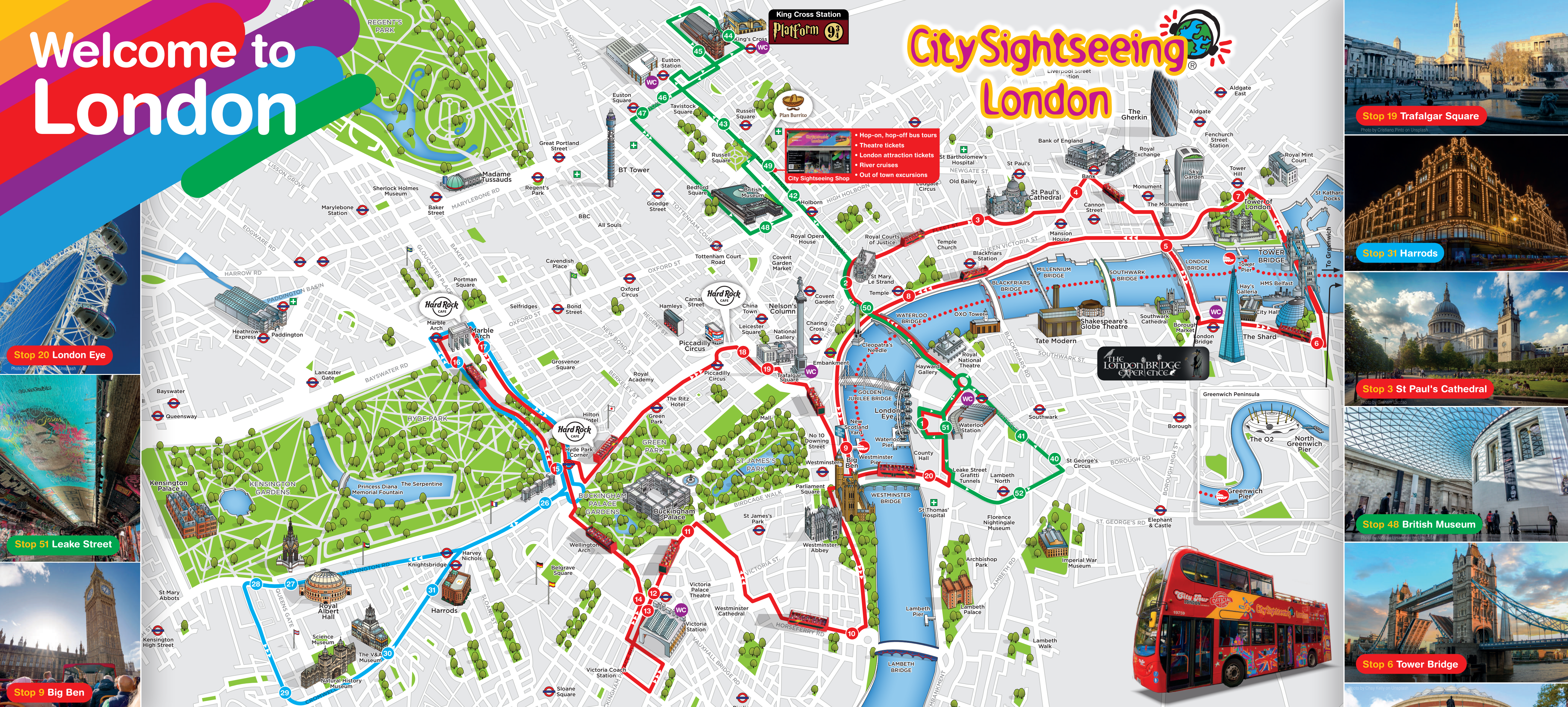
Stop 19 Trafalgar Square